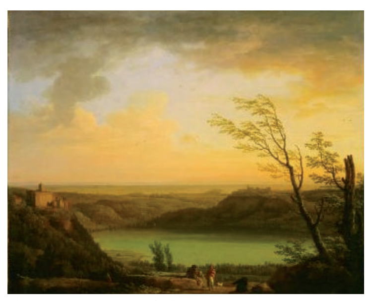
Claude-Joseph Vernet, View of Lake Nemi , 1748, National Gallery of Canada, Ottawa (Figure 1)

This hitherto unrecorded picture signed, inscribed and dated 1803, shows the small volcanic crater of Lagodi Nemi in the Celli Albani range of mountains south of Rome, bathed in a characteristically even, gentle light. The picturesque town of Nemi is perched on the hilltop with its monumental palazzo buonovale , and on the opposite side of the lake in the distance is the small town of Genzano (fig. 2). The sea is visible on the horizon with the soft silhouette of Monte Circeo beyond. The three small fishing boats on the lake hint at the Emperor Caligula's famous scuttled pleasure boats, rediscovered during the Renaissance and which were finally salvaged in 1929 on the orders of Benito Mussolini (1883-1945). The name Nemi derived from the Latin neumus Ariceum , or 'grove of Ariccia', which was the ancient site of a temple sacred to the goddess Diana. Hackert appears to have only painted this particular view in two other versions, both dated 1784.