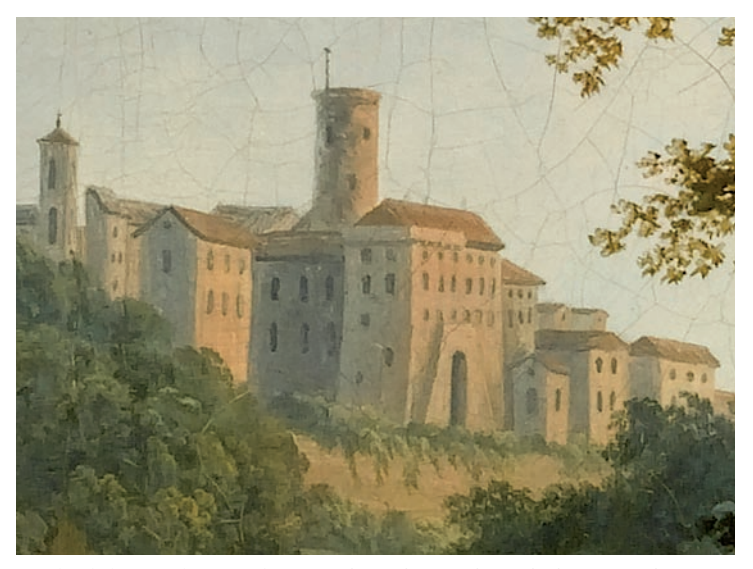
Jacob Philip Hackert, Lake Nemi from the North, with the Town of Nemi and the Town of Genzano beyond, with a Donkey and Travellers on a Path in the Foreground (Detail)

more beautiful and better ordered than nature itself. Italian Landscape in the Hermitage's collection epitomises this Claudean philosophy (fig. 4). Bathed in soft peachy hues, the tranquillity of the waters are juxtaposed with the rising architecture of the small hill town showing a classical, idealised landscape bearing close similarities to the present work.