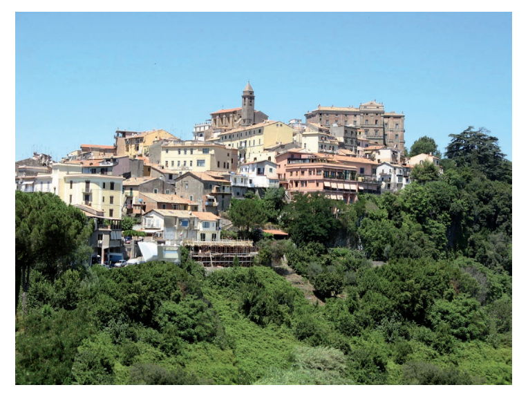
Photograph of Genzano (Figure 2)

The landscape of Lake Nemi was also treated by Hackert's travelling companion, the British Romantic painter and watercolourist John Robert Cozens (1752-1797) (fig. 3). Like Hackert's, Cozens' work often reflected the classical compositional formulae of Claude Lorrain (c.1604/5-1682), Nicolas Poussin (1594-1665) and Gaspard Dughet (1615-1675).